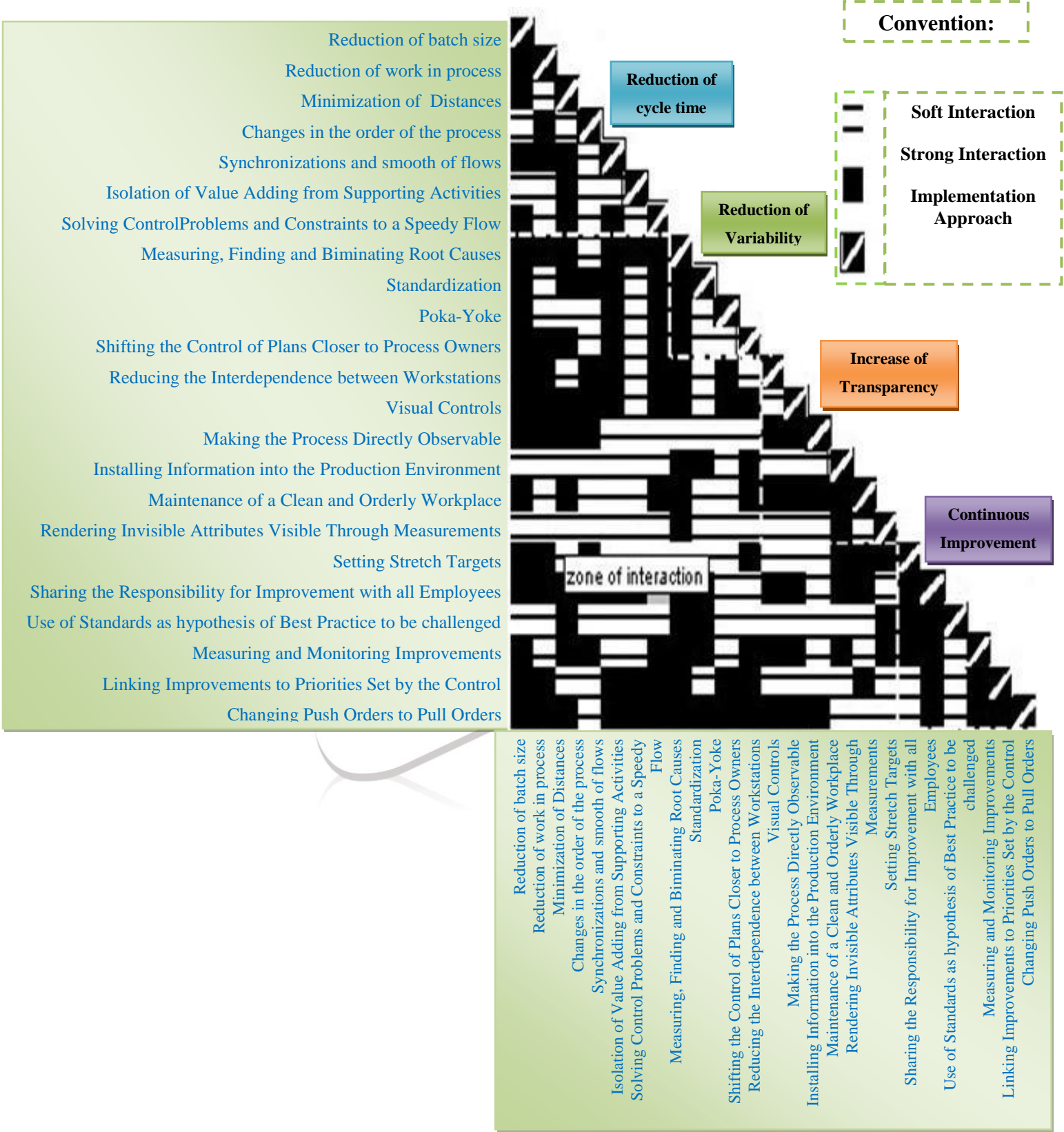
Fig. 3 Theoretical Interactions among the Four Core Principles

It is reasonable to expect that principles derived directly from the same concept should be complementary to each other. Indeed, in theory each principle and the correspondent 'implementation approaches' should reinforce in different levels of intensity all the principles derived from the same concept. Figure 2 indicates the degree of interactions between cycle time reduction and other three principles, based on a literature review carried out in this research project.