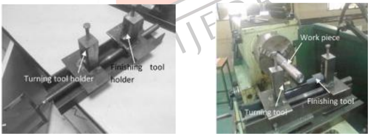
Figure 5: Machine set up

In 2013, M. Moses & Dr. Denis Ashok <sup>[6]</sup> M. Tech, Mechatronic from School of Mechanical and Building Science, VIT University, Vellore, India published titled as Development of a new machining setup for energy efficient turning process. In the production unit, lathe is one of the important protection machines. This paper focuses on producing a quality product in lathe machine with less power consumption. In order to achieve that, a special setup is developed in the lathe machine for turning and finishing of the components, to achieve quality product and also to improve the productivity. As a result of this new approach, profuse amount of energy can be saved, quality product can be obtained and tool life can be increased. The study aimed at evaluating the best process environment which could simultaneously satisfy requirements of both quality and as well as productivity. By conducting many experiments it was found that this special setup process improves the quality and also reduces the power consumption as compared with the existing process. Figure of developed attachment as shown below,