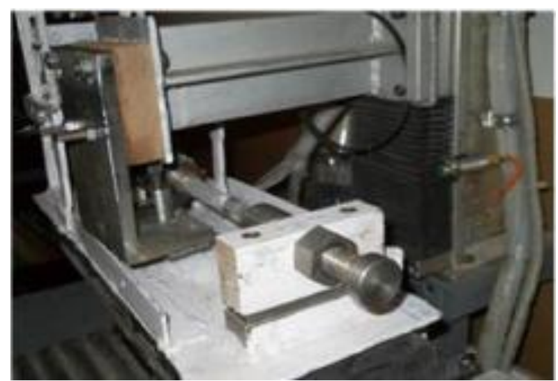
Figure 2: Developed attachment

Developed design is successfully implemented in the proposed work for the development of the lathe attachment including headstock, tailstock and tool post. The work shows the process of the conceptual design and use of proper process planning for the development of the different components of the lathe attachment. The previously attachment and developed lathe attachment make the CNC machine multifunctional. Thus further research can be carried out in both the fields respectively. The CNC machine is based on the mechatronic controls and the computer interface CAMSOFT. Various lathe operations like plain turning, step turning, taper turning, arc turning, threading operations and manufacturing of a bolt are successfully performed on the CNC machine, when installed with lathe attachment. The successful development of the lathe attachment for the CNC machine is done.