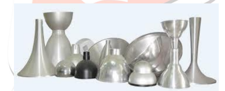
Fig.1. Spinning Component

Metal spinning is one of the oldest method of chip-less formation. Metal spinning is the technique to produce axisymmetrical part or component over rotating mandrel with the help of rigid tool known as roller .During the process both the mandrel and blank rotated while the spinning tool contract the blank and progressively induce a change according to the profile of the mandrel. Spinning process help to produce a lightweight component. The component of metal spinning are cylinders, drums, Domes, hemispheres, cones, cups etc. as shown in Figure.1 .These component are used for domestic purpose, aerospace application , automobile application etc. Over the last few decades, sheet metal spinning has developed significantly and spun products have been widely used in various industries. This method has been developed to reduce the material deformation and wrinkling failure of the spinning process. By using these techniques in the process design, the time and materials wasted by using the trial-and-error could be decreased significantly. In addition, it may provide a practical approach of standardised operation for the spinning industry and thus improve the product quality, process repeatability and production efficiency[1].