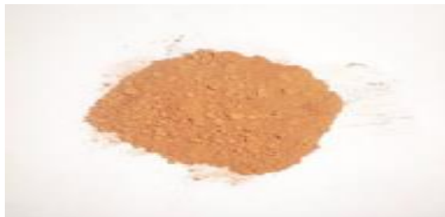
Fig -1: Red Mud

industrial development. Therefore, we need to promote the industrialization of precious metal recovery processes, optimize complex processes and develop new ones. Although the added value is relatively low, the resources utilization of red mud is the most widely used way and the most effective way to resolve the red mud stockpiling problem. Red mud can also be used to produce other construction materials. A mature, relevant technology would greatly promote the consumption of red mud. Applying red mud as an environmental remediation material is a new hot point in terms of utilization. Due to the simple process, low cost, it is worth promoting its application in the field of environmental protection. However, there is a risk of introducing new contamination, and a difficulty of recycling it after the application.