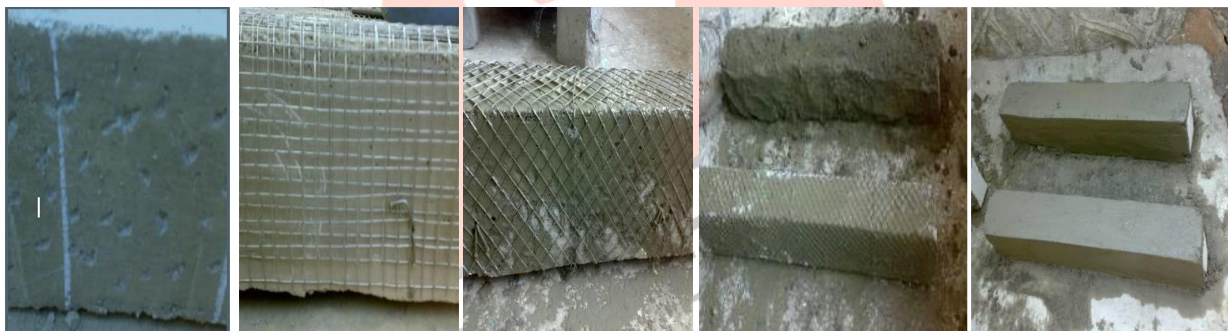
Fig 3: Process of Retrofitting

After first stage of loading, the distressed beams were retrofitted by using ferrocement jacketing. Ferrocement is another form of reinforced concrete in which cement sand mortar is reinforced with closely spaced MS welded wire mesh. In this study, square grid MS welded wire mesh (wire mesh of 16 mm x 16 mm x 0.8 mm diameter) was used for all specimens in single, double layer at 0° and 45° orientations. The surfaces of the distressed beam were roughened by using hacker and wire mesh was wound over it. The mesh was tightened using binding wires. A thick cement paste was applied as bonding agent before application of mortar in order to get a good bond. Plastering was done with cement mortar having the ratio of 1:3 by weight and water cement ratio was kept as 0.5. The 20 mm thickness of mortar was applied on the beam surface. The retrofitted beams were cured for 28 days in curing tank.