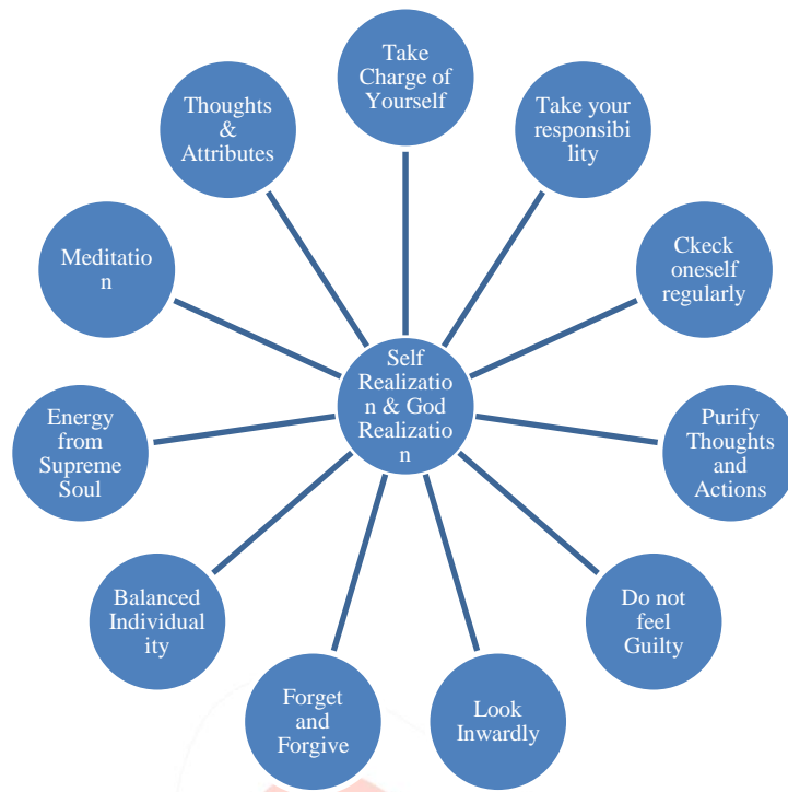
Fig 2 : Cycle of Spirituality and Meditation