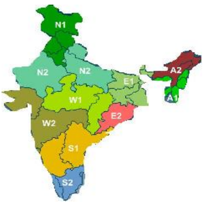
Figure 3: Grid Distribution as per Bid Area