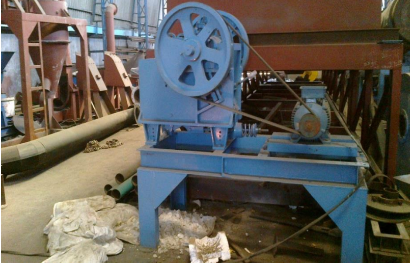
Fig.1 Typical Jaw Crusher [10]

The first stage of size reduction of hardand large lumps of run-of-mine (ROM) ore is to crush and reduce their size. Softer ores, like placer deposits of tin, gold, mineral sands etc. do not require such treatment. Large scale crushing operations are generally performed by mechanically operated equipment like jaw crushers, gyratory crusher and roll crushers. For very large ore pieces that are too big for receiving hoppers of mechanically driven crushers, percussion rock breakers or similar tools are used to break them down to size. The mechanism of crushing is either by applying impact force, pressure or a combination of both. The jaw crusher is primarily a compression crusher while the others operate primarily by the application of impact. [11]