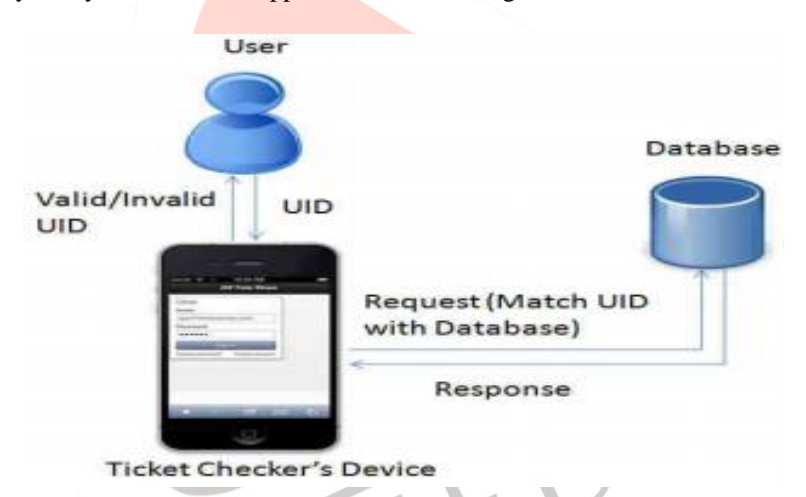
Fig 2: Checker Application

The application frees the ticket checker from all the paper work and makes his job much simpler. He just needs to enter the UID of the passenger's ticket and the application will convey him about the validity of the ticket. When the ticket checker enters the UID of the ticket, a request is sent to the server. The server then checks this UID with the database and verifies that such an UID is issued an also confirms that the time of the ticket has not been elapsed and is a valid ticket. The validity of the ticket is for a threshold value which depends upon the time required for the respective journey. Once the threshold value will be reached t will be instinctively invalidated by the system. Checker application shown in figure 2.