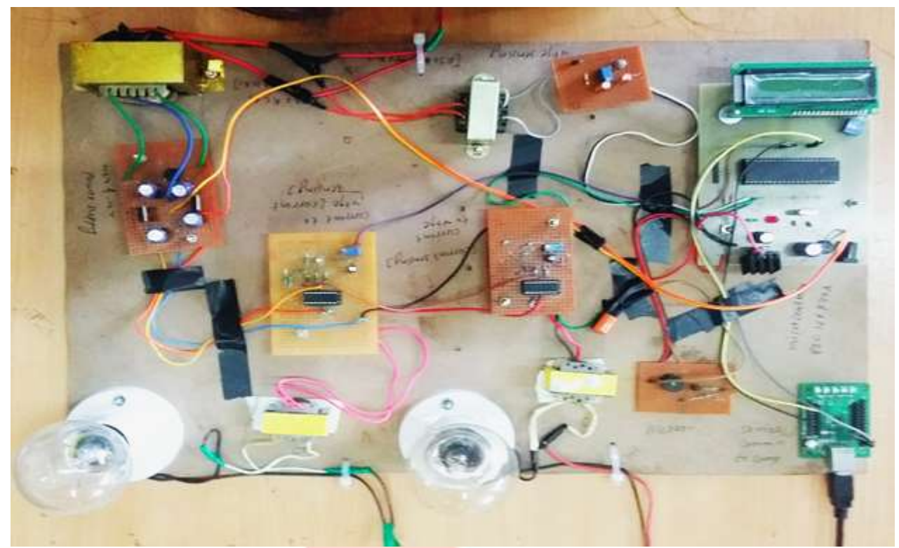
Fig 2. Monitoring section model

Calculatoins of power supply circuit V1=230V, V2=12V, P=6VA Diode Rating 1)P1= V2 I2 6=12*I2I2=6/12 = 0.5A2) V1=di/dt =0.5*50= 25V3)Capacitor Rating