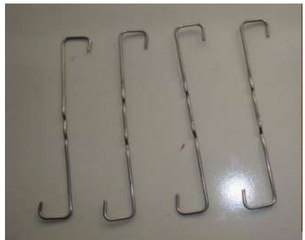
Figure1. S-type wall ties

During construction of a cavity wall the inner and outer parts are anchored by metal ties laid in the horizontal mortar joints. They are arranged in a definite pattern. It is essential that the air space be kept continuous and not bridged by mortar or other material that will allow water to pass across the cavity. In this work S-type wall ties (Fig.1) are provided.