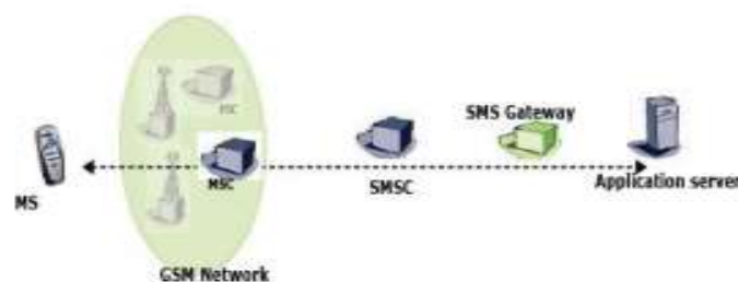
Figure 1: SMS Architecture

Short messages are delivered in GSM signaling channels between the Mobile Station (MS) and the Base Transceiver Station (BTS). The messages flow as normal calls, but they are routed from the MSC to a Short Message Service Center (SMSC). The SMSC stores the message until it can be delivered to the recipient(s) or until the message's validity time has elapsed. The recipient can be a normal MS user or a SMS gateway. The gateways are servers that are connected to one or more SMSCs to provide SMS applications for the MS users. These applications include ring tone and icon delivery, entertainment, bank services, and many other beneficial services.