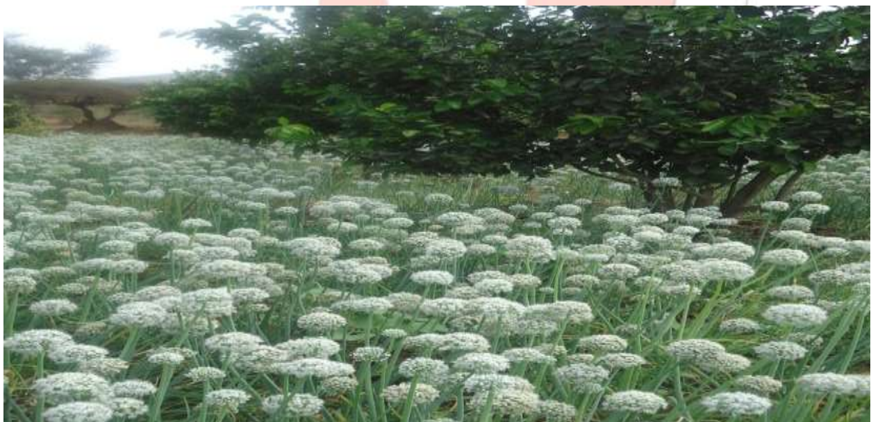
Figure 5. Onion seed production plots inter cropped with orange fruit at M. lekhe in 2012