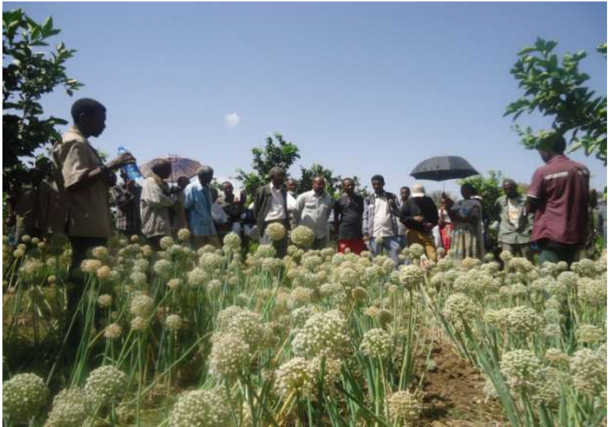
Figure 4. Stakeholders evaluation of the technologies at M. lekhe 2012 at field day