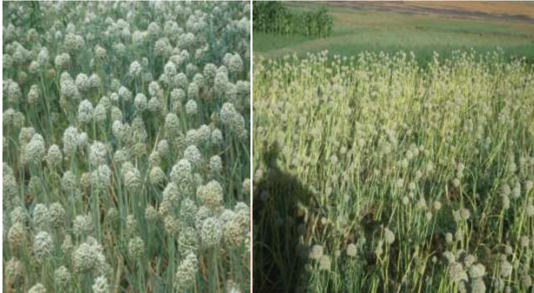
Figure 3. Onion production plots at M.lekhe (left) and L.maichew (right)

As the above bar graph shows, the average seed yield was recorded 5.75 qt/ha while the maximum yield was 9 qt/ha. The minimum yield was 3 qt/ha/ this variability among farmers is due to the field and cultural practice difference among the farmers.