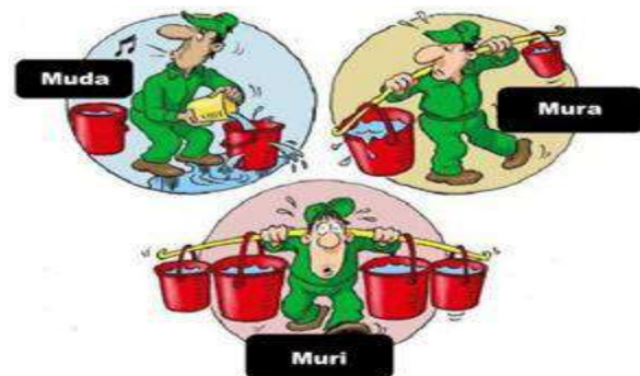
Figure 1 Illustration of muda, mura and muri.

MURI: Any activity asking unreasonable stress or effort from personnel, material or equipment. In short: OVERBURDEN For people, Muri means: a too heavy mental- or physical burden. For machinery Muri means: expecting a machine to do more than it is capable of- or has been designed to do.