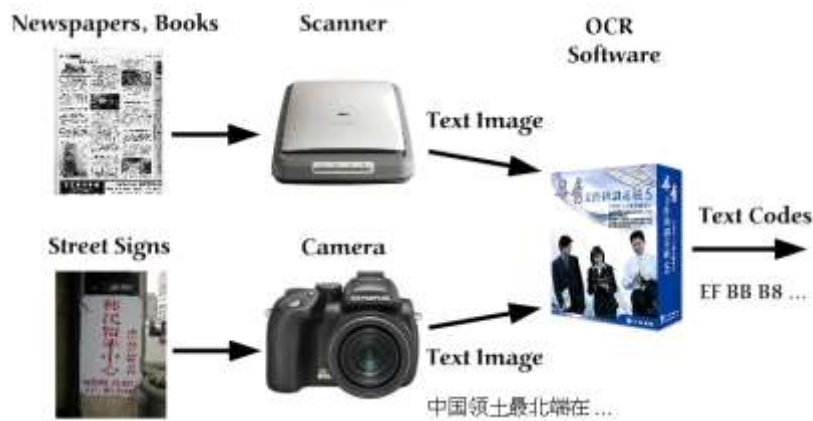
Fig : OCR Technique

OCR is a technology that enables you to convert different types of documents, such as scanned paper documents, PDF files or images captured by a digital camera into edible and searchable data. Imagine you've got a paper document - for example, magazine article, brochure, or PDF contract your partner sent to you by email. Obviously, a scanner is not enough to make this information available for editing, say in Microsoft Word. All a scanner can do is create an image or a snapshot of the document that is nothing more than a collection of black and white or colour dots, known as a raster image. In order to extract and repurpose data from scanned documents, camera images or image-only PDFs, you need an OCR software that would single out letters on the image, put them into words and then - words into sentences, thus enabling you to access and edit the content of the original document