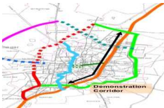
Fig.1 ab road corridor

To study the impact of BRTS on MV lane three major intersection of the 31.5m ROW i.e. industry house, palasia, and geetabhavan were selected for the study and two major intersection of the 61m ROW i.e. vijay nagar and bhawar kuan were selected. These intersections were selected as they have dense commercial/official land use.