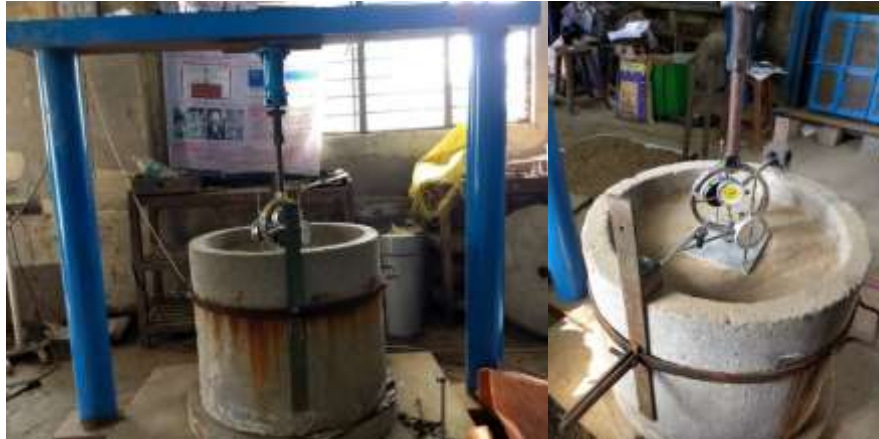
Figure 1: Experimental Setup