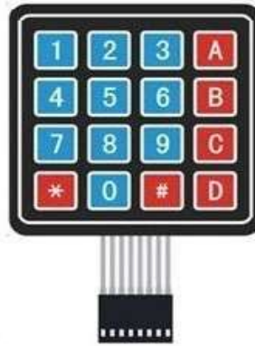
Fig.5 4x4 Matrix membrane keypad

the four columns (pins 1-4) either low or high one at a time, and then poll the states of the four rows (pins 5-8). Depending on the states of the columns, the microcontroller can tell which button is pressed. 4x4 membrane keypad is shown in fig.5.