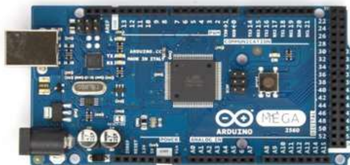
Fig.4 arduino mega (atmega 2560) microcontroller unit