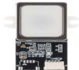
Fig.2 Fingerprint module

Fingerprint processing includes two parts: fingerprint enrollment and fingerprint verification. The GT-511C3 fingerprint scanner is a small embedded module that consists of an optical sensor mounted on a small circuit board. The optical sensor scans a fingerprint and the microcontroller and software provides the modules functionality which automatically processes the scanned fingerprint. When enrolling, user needs to press the finger three times. The system will process the three time finger images, generate a template of the finger based on processing results and store the template. During verification, user press the finger through optical sensor and system will generate a template of the finger and compare it with templates of the finger library. The verification can be 1:1 or 1:N. For 1:1 verification, system will compare the live finger with specific template designated in the Module; for 1: N matching, or searching, system will search the whole finger library for the matching finger. In both circumstances, system will return the verification result, success or failure. Fig.2 show the fingerprint module[6].