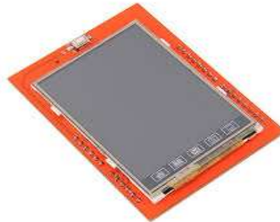
Fig.3 LCD display unit

A Thin-film-transistor liquid-crystal display (TFT LCD) is a variant of a liquid-crystal display (LCD) that uses thin-film-transistor (TFT) technology to improve image qualities such as addressability and contrast. A TFT LCD is an active matrix LCD. Arduino 2.4" TFT LCD Touch shield is an Arduino UNO/ Mega compatible multicolored TFT display with touch-screen and SD card socket[3]. It is available in an Arduino shield compatible pin out for attachment. The TFT driver is based on S6D112 with 8bit data and 4bit control interface[4].