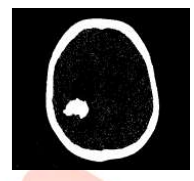
FIG.5 K-MEANS CLUSTERING