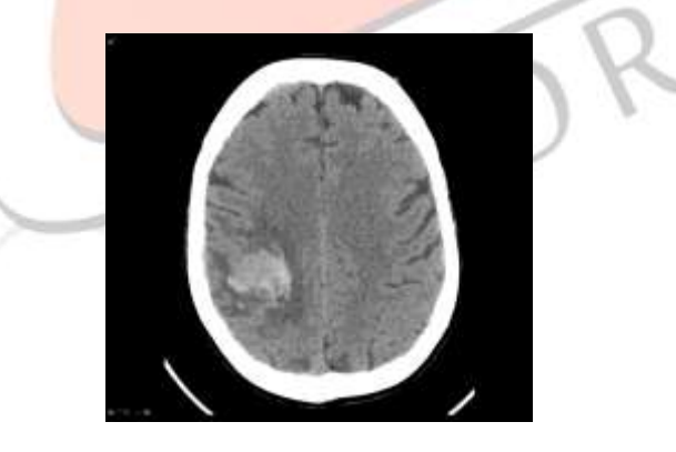
FIG 1. FILTERED OUTPUT

The pattern of neighbours is called the "window", which slides, pixel by pixel over the entire image and removes the noise from it. For 1D signals, the most obvious window is just the first few preceding and following entries, whereas for 2D (Two dimensional) signals such as images, more complex window patterns are possible (such as "box" or "cross" patterns). Note that if the window has an odd number of entries, then the median is simple to define: it is just the middle value after all the entries in the window are sorted numerically. For an even number of entries, there is more than one possible median. This filter enhances the quality of the MRI image. At the last we got image without noise. Instead of this filter we can use other filter also but we will not get correct output this filter is more convenient then other filter ( Reference- Sivasankari, Sindhu, Sangeetha, Shenbaga Rajan IJIRSET )