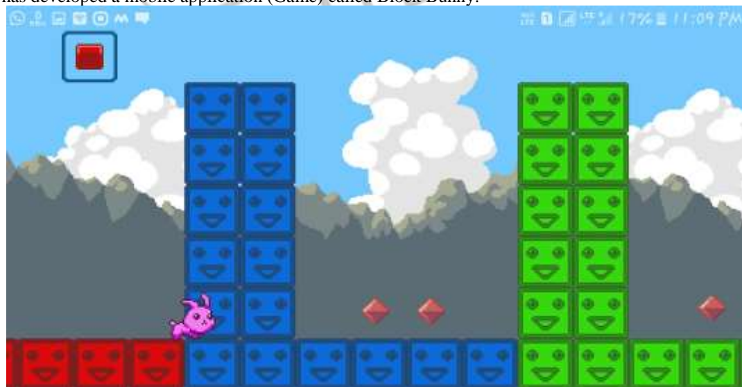
Fig.1 Snapshot of Game bunny called Block Bunny.

This architecture has developed a mobile application (Game) called Block Bunny.