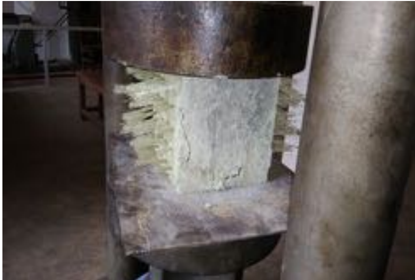
Figure 8 Cube being tested on Compression Testing Machine