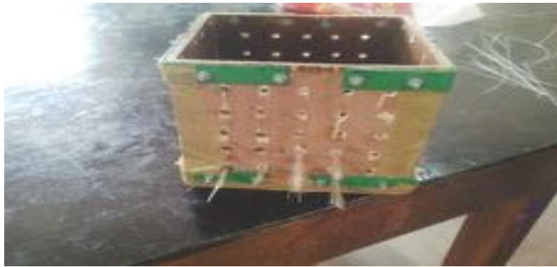
Figure 4 Transparent Concrete Moulds