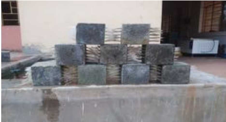
Figure 7 Specimen taken from curing tank

The casted cubes shall be stored under the shed at a place free from vibration at a temperature 22°C to 23°C. The cubes are cured for required number of days.