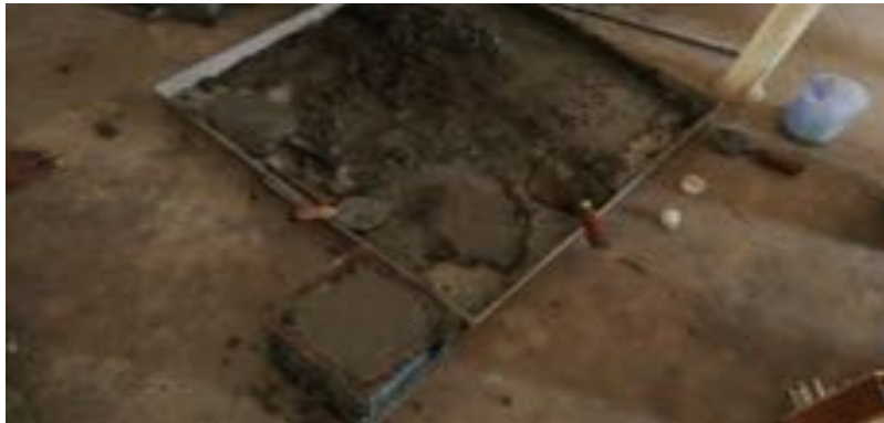
Figure 3 Casting of Moulds

The specimens were prepared by compaction the concrete in three layers. Table vibrator was used for compaction of concrete. After completion of compaction, excess material was removed and the mould was leveled by using a levelling plate. The standard moulds were fitted such that there are no gaps between the plate of the moulds. The moulds then oiled and kept ready for casting. The materials were mixed in a pan and they are placed in moulds and compacted by placing them in vibrating machine. At the end of casting the top surface of the cube was made plane using plane and a hacksaw blade to ensure a top uniform surface. After 24 hours of casting, the moulds were kept for wet curing for the required number of days before casting.