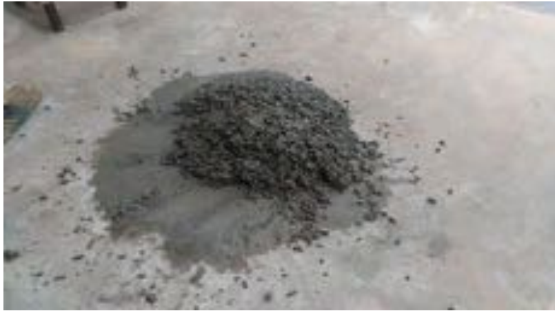
Figure 2 Mixing of Materials