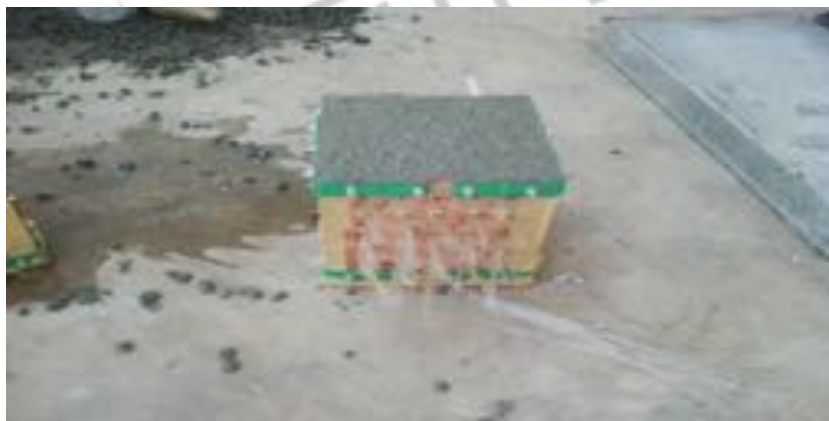
Figure 6 Concreting of mould

The thoroughly mixed concrete is poured carefully and slowly without causing much disturbances to the previously laid optical fibres. The concrete is filled in smaller or thinner layers and is agitated with the help of vibrating tables to avoid the void formation.