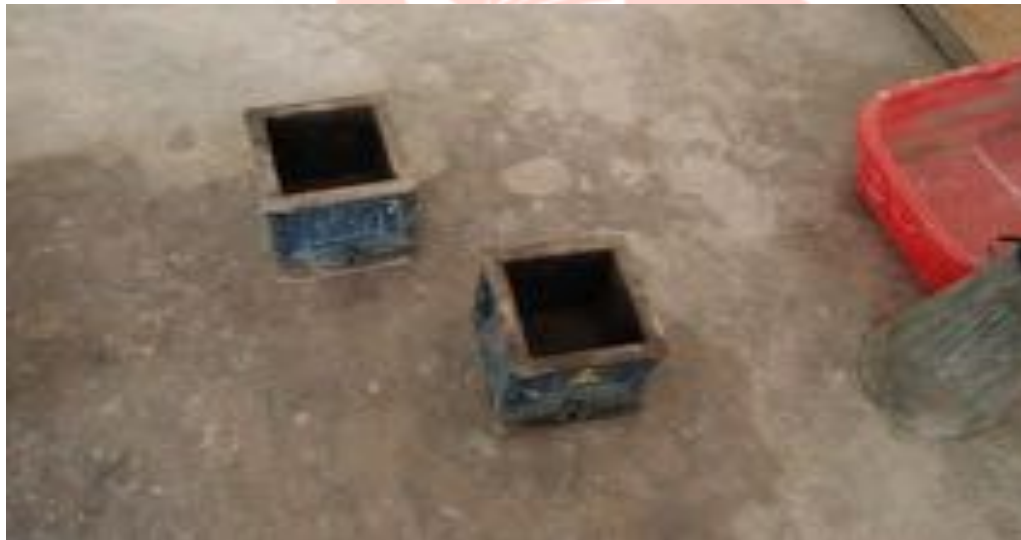
Figure 1 Cube Mould

Standard cube moulds of 150x150x150mm made of cast iron were used for obtaining compressive strength. 9 number of cubes of same size shall be cast, 3 for 7 days c,3 for 14 days and 3 for 28 days testing. A sample consists of 3 cube specimens and their average compressive strength represents the test result of that sample.