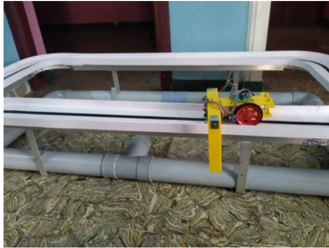
FIG AUTOMATIC GAS LEAKAGE DETECTION AND PREVENTION SYSTEM ROBOT