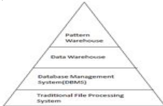
Fig2: Generation of Data storage Repository

In this figure the different kinds of repositories used for data storage from past decade to till now are shown.