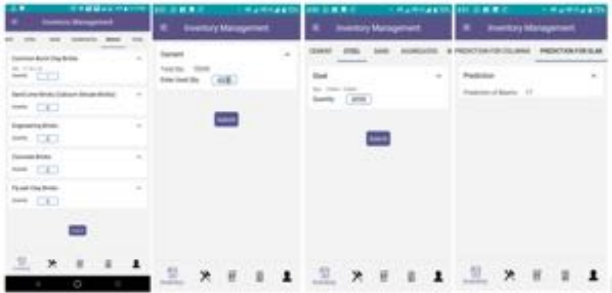
Figure 2 shows Login Page, New Registration, Submenu in the CAST application & Stock Management page. Figure 3 shows Report entry page (Daily, weekly, monthly bases), Challan upload page. Figure 4 shows images related to the inventory management.