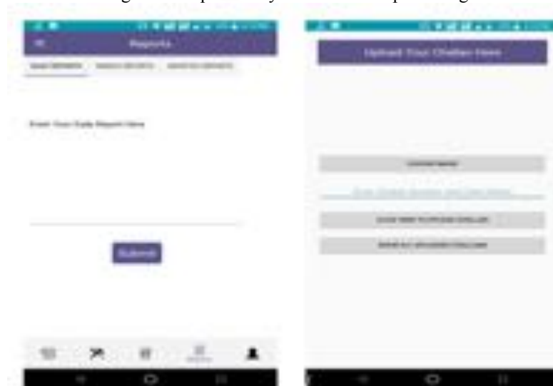
Figure 3: Report Entry and Challan Upload Page

Challan are nothing but bills that the user can upload in this applications which can be viewed at the admin. This helps the admin to make sure no temperament has been done in the bills i.e. corruption can be halted. Also makes easy to budget the things.