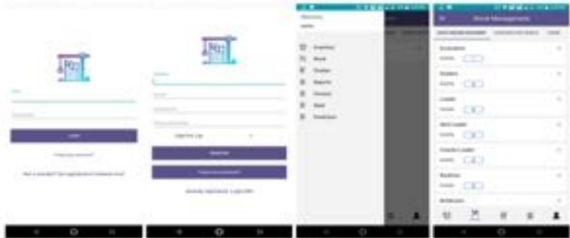
Figure 2. Login Page, Sign-Up Page, Submenu Page, Stock Management

Functions in Construction Site Analysis & Tracking are as follow: