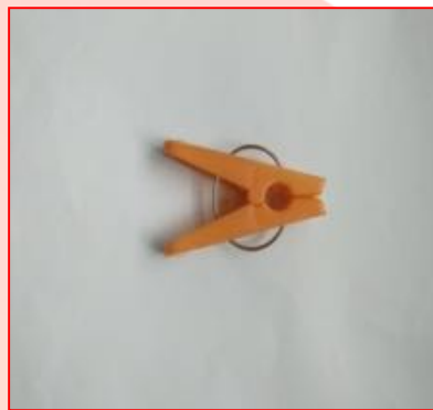
Figure 1: Cloth peg assembly

A cloth peg is a fastener used to hang up clothes for drying, usually on a clothes line. They are made from plastic, metal or wood. A ring, spring or U-pin is inserted between the two parts of the cloth peg. The assembly of the cloth peg (two plastic pieces and ring) can be done manually by workers, or by semiautomatic or fully automatic machines.