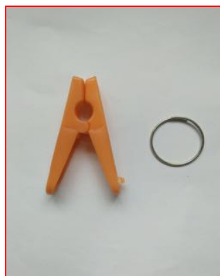
Figure 2: Cloth peg assembly parts