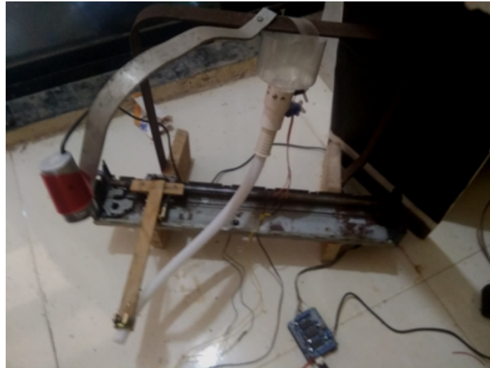
FIG.3 Implemented system of pothole repair

The truck base had to allow for substantial material storage and weight, easy mobility in repair situations, excellent visibility for the operator and flexibility in design features to accommodate the various repair equipment modules that would have to be mounted.