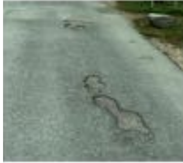
FIG.1 A pothole caused by fatigue failure

pavement. Most are found on local road and street systems: 80% of the nation's roads are local roads and are more apt to have "just grown" rather than being planned from the start and are much more likely to have water, gas and other utilities underneath. [1]"