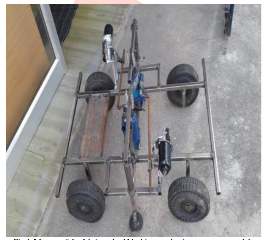
Fig 1.5 Image of the fabricated self-jacking mechanism prototype model.