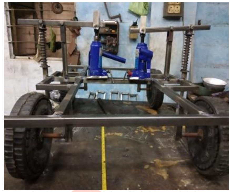
Fig 1.4 Image of the chassis frame fitted with hydraulic jacks.