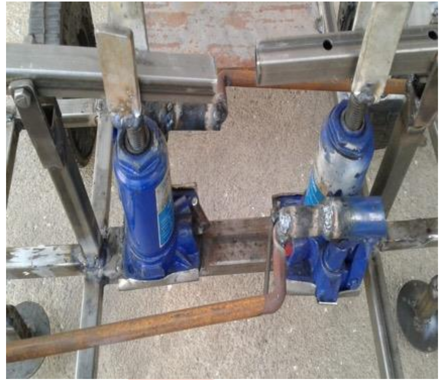
Fig 1.2 Image of two hydraulic jacks fitted on the frame.