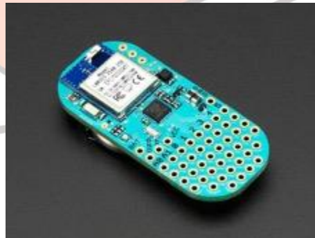
Fig. Light Blue Bean Arduino