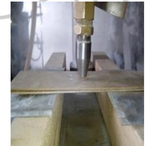
Fig 3: Nozzle fixed to set up Table 1: Characteristics Of Different Variables

The exploratory work was carried on a test rig. The rough corn meal (Al2o3, Sic) were blended in with air stream in front of the spout and the grating stream rate was kept consistent all through the machining procedure. The fly spout was made of Tungsten Carbide to convey high wear opposition and increment in Life of spout. A few spouts were fabricated with various bore breadths of 1 mm, 2 mm and 3 mm. Penetrating of glass sheets was directed by setting the test rig on the parameters like Pressure, SOD and Nozzle breadth, Abrasive stream rate.