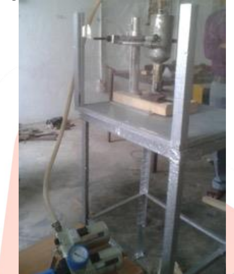
Fig 2 : Fabricated Experimental Setup of Abrasive jet Machining

Main machine structure of size 250x250x550 has been fabricated. Lifting mechanism parts have been machined & assembled as shown in Fig. Mixing chamber & hopper have been machined out of M.S sheet and welded. The opening for the abrasive Particles was arranged with air tight and leak proof system.