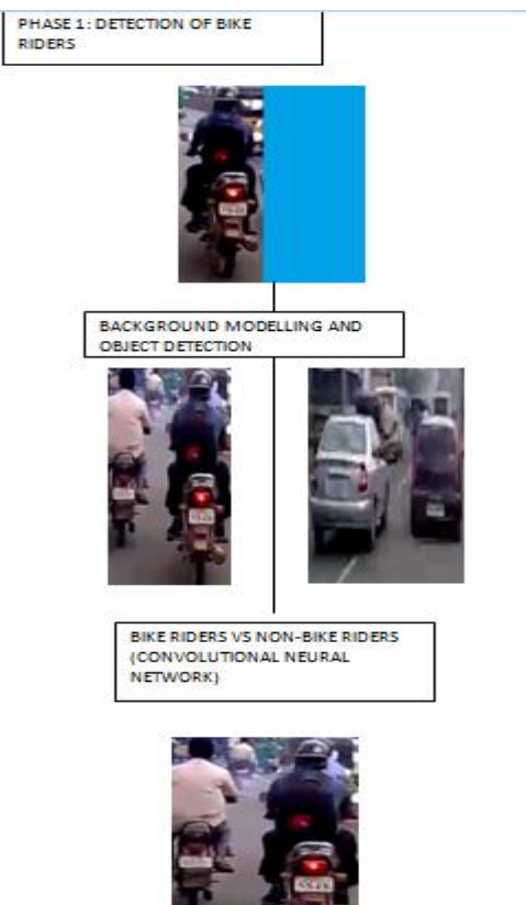
Fig. 1. Stages of phase I with initial preprocessing

Fig. 1 shows the block diagram of the phase 1 of the proposed system. In the proposed system, first we apply adaptive background subtraction to detect the moving objects. These moving objects are then given to a CNN classifier as input which then classifies them into two classes, namely, motorcyclists and non motorcyclists. After this, objects other than motorcyclists are discarded.