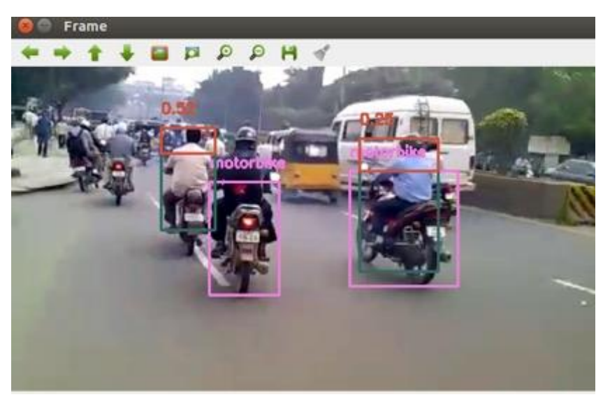
Fig .5. CNN Image capture detection of bikes and helmet analysis