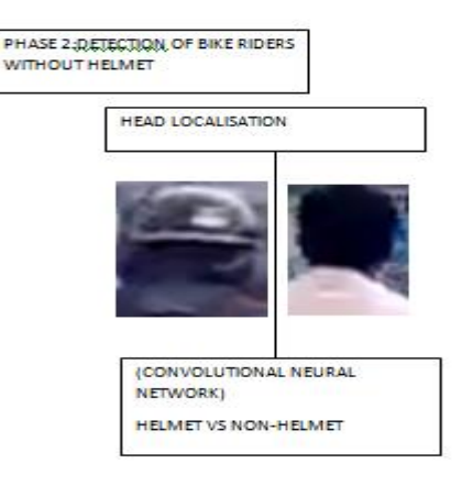
Fig. 2. Stages of phase II to detect drivers without helmet