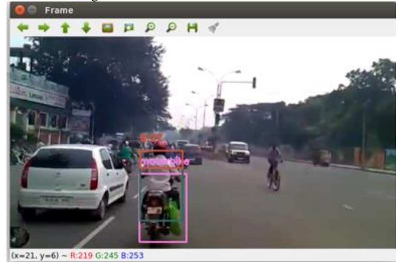
Fig .4. CNN Image capture detection of bikes

From the Fig.4 and Fig.5 it is obvious that the motorbikes and helmet along with the person has been detected. The exact positioning of the camera helps to reduce the errors. The motorbikes have been extracted from other vehicles and people who are wearing helmet are projected with bounding boxes and shown as the outcome.