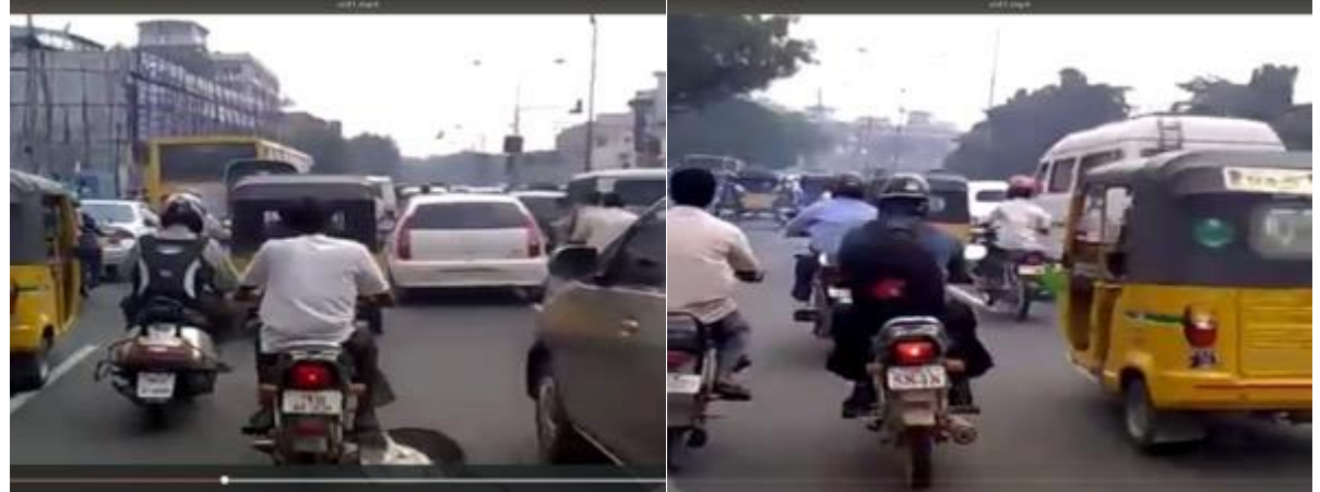
Fig.3. Real time video captured and the motion frames collection

The performance of the proposed approach is evaluated on two video datasets containing sparse traffic and dense traffic as shown in fig.3.