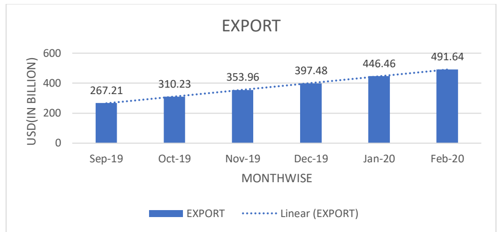
Figure 1: Represents export of goods and services from India during September 2019 to February 2020

India's overall exports (Merchandise and Services combined) in April-February 2019-20* are estimated to be USD 491.64 billion, exhibiting a positive growth of 2.13 per cent over the same period last year during COVID-19 period. So COVID-19 has positive effect on export of product for very short period of time. This effect can be represented through the following diagram (No.1).