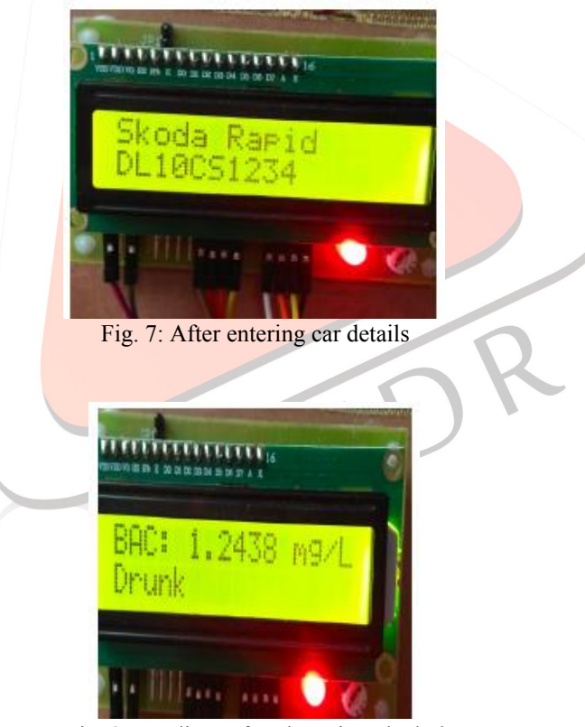
Fig. 8: Readings after detecting alcohol