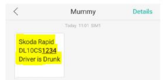
Fig. 9: Message received after alcohol is detected