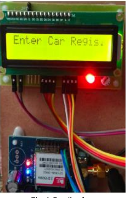
Fig. 6: Details of car