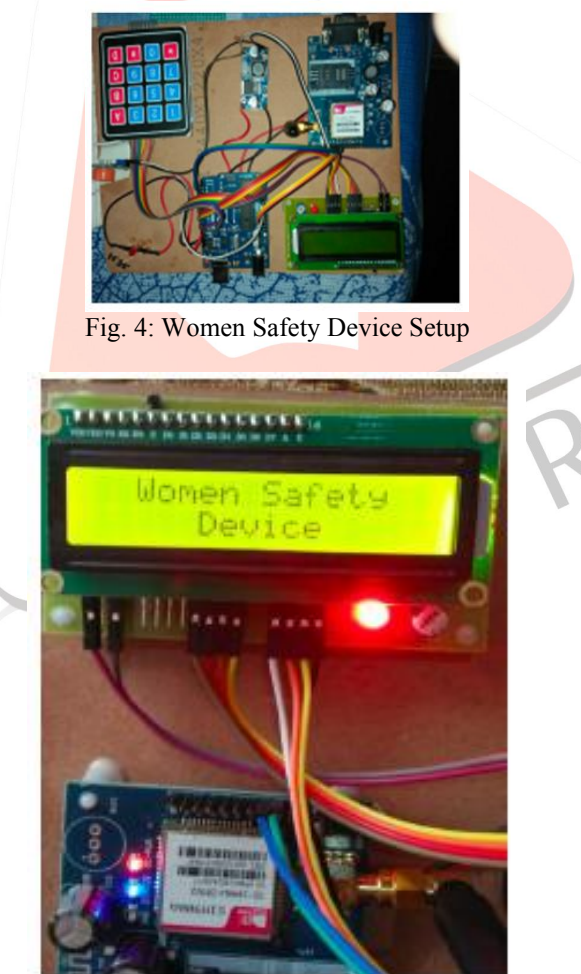
Fig. 5: LCD display with Project Title