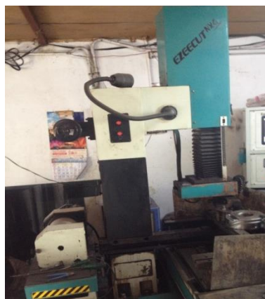
Fig3.1 Ratnapakhi CNC Wire EDM-5530