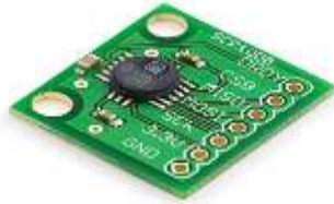
Fig 6: MEMS Sensor

MEMS accelerometers are one of the simplest but also applicable micro-electromechanical systems. They became indispensable in automobile industry, computer and audio-video technology. This seminar presents MEMS technology as a highly developing industry.