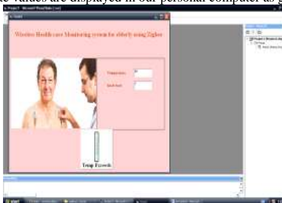
Fig 8: Temperature & Heart beat rate display

The temperature and heart beat rate values are displayed in our personal computer as given below.