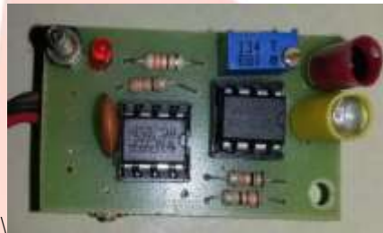
Fig 4: Heart beat sensors

The sensor consists of a light source and photo detector; light is shone through the tissues and variation in blood volume alters the amount of light falling on the detector. The source and detector can be mounted side by side to look at changes in reflected light or on either side of a finger or earlobe to detect changes in transmitted light. The particular arrangement here uses a wooden clothes peg to hold an infra red light emitting diode and a matched phototransistor. The infra red filter of the phototransistor reduces interference from fluorescent lights, which have a large AC component in their output.