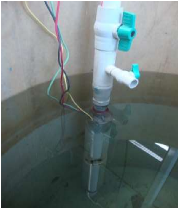
Fig. 5 submersible pump