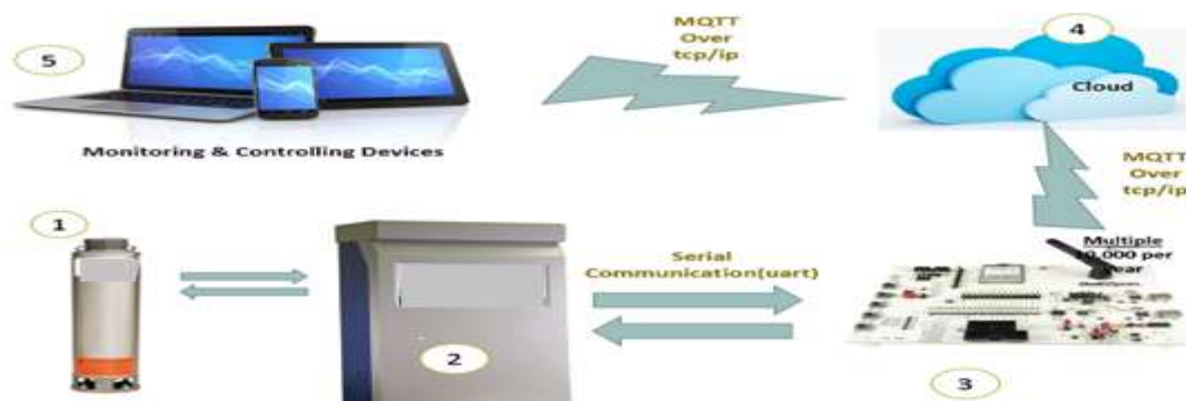
Fig. 1 block diagram

Variable frequency drive (VFD) will acquire data from sensor which is mounted on pump, which then will be transmitted to the main Board using Serial communication.