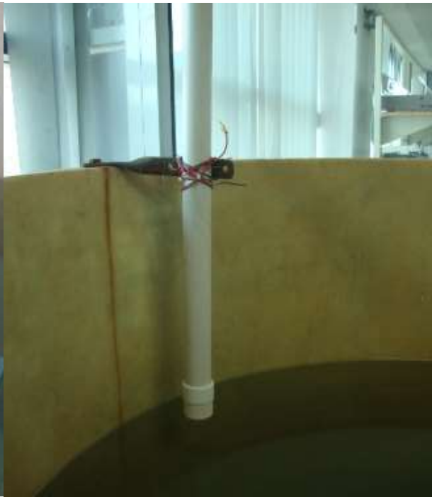
Fig. 4 Outlet