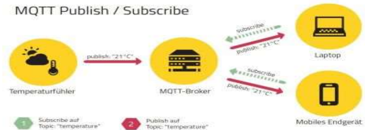
Fig. 2MQTT Publish/Subscribe [10]

MQ Telemetry Transport (MQTT) is a publish/subscribe messaging protocol based on broker also it is light weight protocol is designed to be open, simple, lightweight and easy to implement. These characteristics make it ideal for use in constrained environments, for example, but not limited to: Where the network is expensive, has low bandwidth or is unreliable when run on an embedded device with limited processor or memory resources.