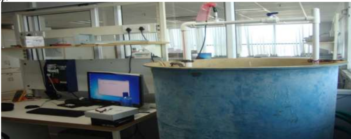
Fig. 3 System setup