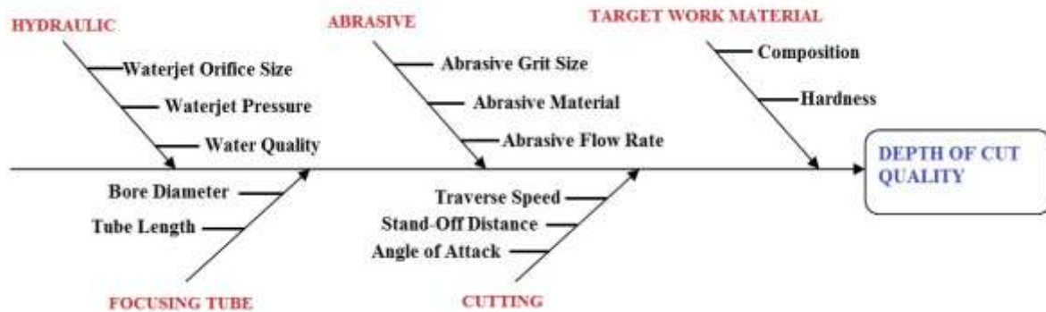
Fig. 1.2 Process Parameters of AWJM [11]

Abrasive water jet machining is considered to be a rapidly growing technology capable of processing a variety of materials. Since AWJ machining relies on erosion by fine abrasive particles, mechanical loads exerted on the work piece are small, and the flow of water leads to very low thermal stress on the work piece. For the application of the abrasive jet as a milling tool, the capability of the AWJ technology for accurate depth cutting is still a challenge. Since there are several parameters that affect the material removal rate and profile, such as pump pressure, jet feed rate, abrasive mass flow rate, stand-off distance, and abrasive breakage inside the cutting head, it becomes difficult to obtain the desired local material removal. Therefore, one of the main factors of the success of this process is an accurate understanding of the jet properties at the exit of the cutting head.