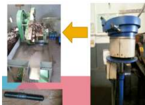
fig.4 automation process

The studs are first introduced in the hopper. The studs are conveying forward in the hopper with help of vibration of vibrator.