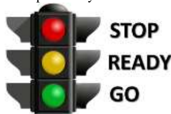
Figure 2 . Automatic Traffic Control Light based on timer

As we know Timers and electrical sensors are very much useful in automatic controlling of traffic signals. It is possible to load any value of timer that one wants for each stage. With respect to this value timer values, the signal automatically grows ON and OFF periodically. The presence of the vehicle and signals on each phase are caught by the sensors and with this, signal the lights automatically operated. This helps actually to control heavy traffic congestion considering timing.