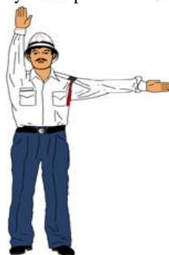
Figure 1 Traffic Control by Traffic Police[7]

In the current era simplest form of traffic management is used in which human operates traffic flow on the road. In this system, a traffic officer is placed on every cross roads; the flow of traffic is controlled by traffic police As shown in fig. 1, a police officer stands on cross road and observes the traffic flow. At the time of congestion she/he gives signals to the vehicle driver regarding to when to drive and when to stop. Meanwhile it is also possible to know emergency cases, so that priority regarding lane can be decided. This technique is very efficient than other techniques But as it includes human as a part of system this scheme is poor. It has very constraints like experience and capability of the person on which Efficiency of system relies.