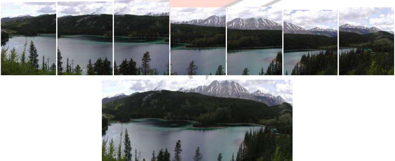
Figure 1: image stitching

Image Mosaicing technology is becoming more and more popular in the fields of image processing, computer graphics, computer vision and multimedia. It is widely used in daily life by stitching pictures into panoramas or a large picture which can display the whole scenes vividly. For example, it can be used in virtual travel on the internet, building virtual environments in games and processing personal pictures.[2]