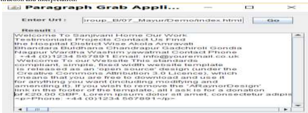
Figure 3 Extracting Paragraph from HTML web Page Document

In this paper, we extracted paragraph from web document. In future the lot of work done on web page. Through an experiment, we confirmed the effectiveness of the method for surveying a topic. Main scope of work on automatic web content Extraction and interpretation.