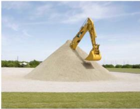
Fig.1: The Backhoe

A backhoe-loader is an Off-highway vehicle and a very useful piece of construction equipment. It is a piece of excavating equipment made of three separate components.