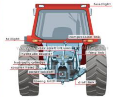
Fig.3: The Tractor