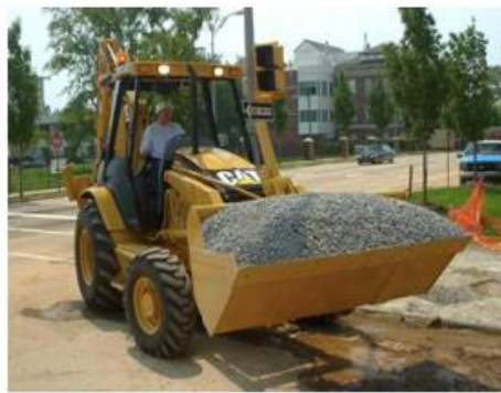
Fig.2: The Loader