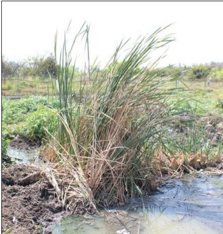
Fig a. Typha angustifolia