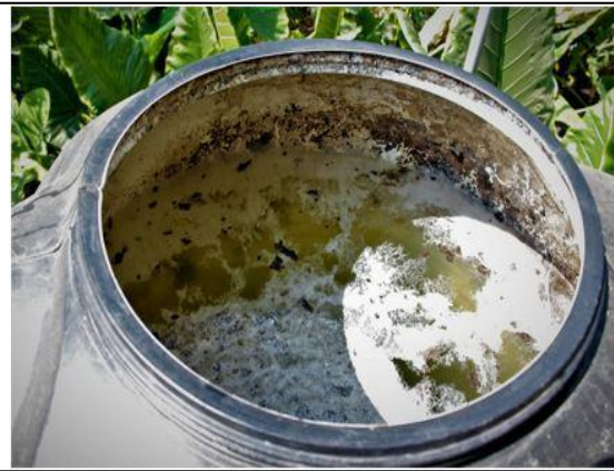
Microbes used for treating organic wastes