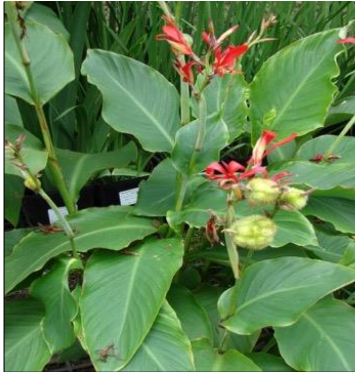
Fig c. Canna indica