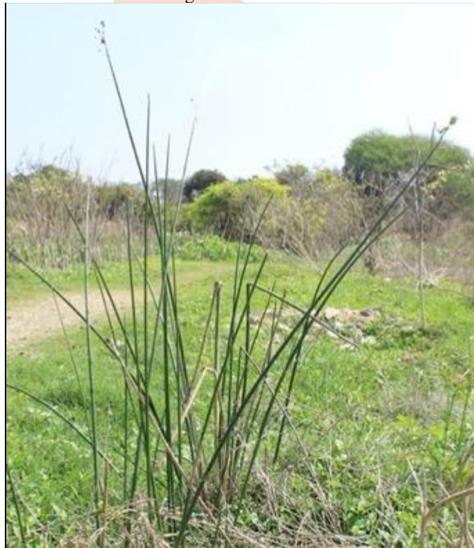
Fig d. Cyperus alternifolius