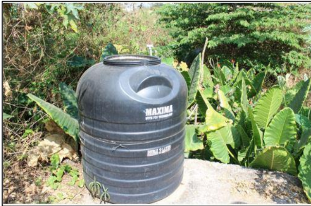
Microbe culture tank