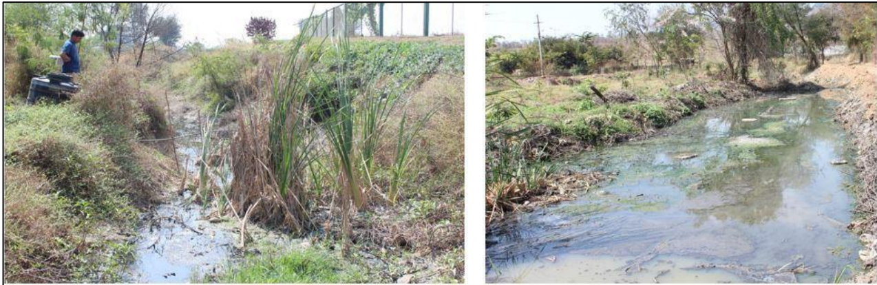
Waste water sent through trenches