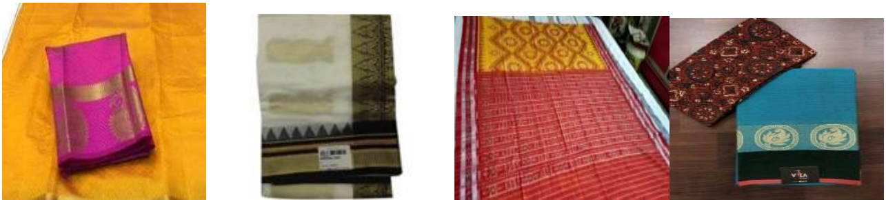
Casual Wear Festive Wear Casual Wear Festive wear