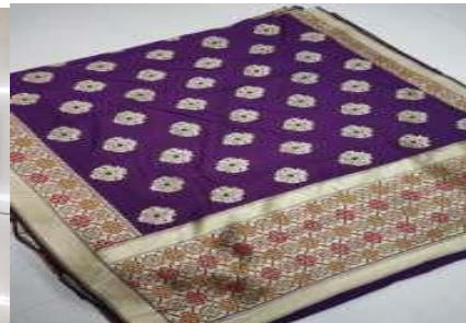
Regular wear Handloom checked sari Banarasi Handloom Silk Sari