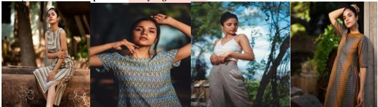
Striped Dress Long Dress Cigarette pants Hand woven Gathered

Sophisticated stripes intricately hand-woven into breathable cotton and dyed using 100% organic dyes. Handloom for both office & leisure wear. A trusted all-season Ikat hand-woven gathered dress in a symmetrical pattern. Maze-like Ikat hand-woven by the weavers of Telangana in patterns inspired by global cultures. Cigarette pants hand-woven in soft & comfortable organic cotton and patterned with hand-block-printed elegant stripes.